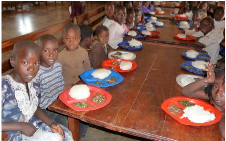
The children enjoying their daily meal of maize, dried fish, and greens